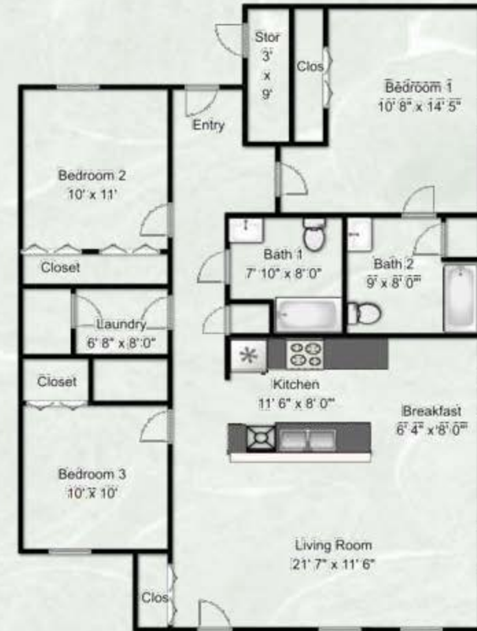
3 Bedroom / 2 Bath Garden Apt. 1,251 sq. ft.