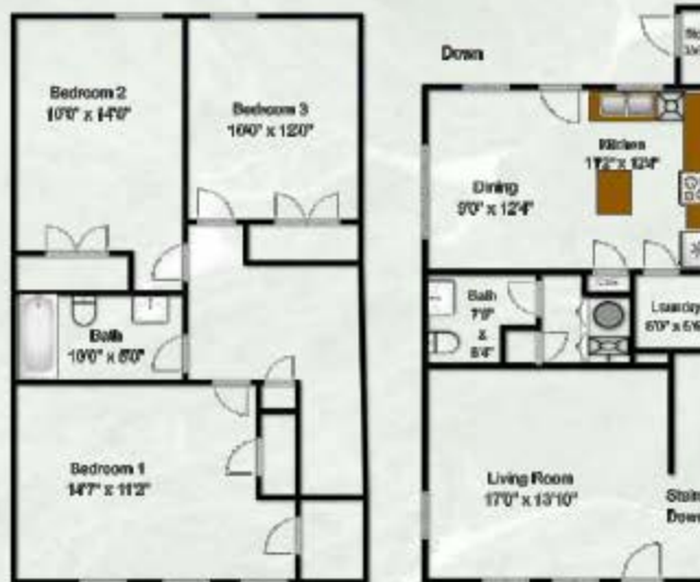
3 Bedroom / 2 Bath Townhome 1,335 sq. ft.

All Dimensions and Square Footages are Approximate