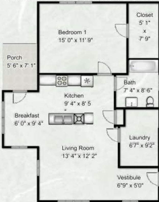
1 Bedroom / 1 Bath Garden Apt. 727 sq. ft.